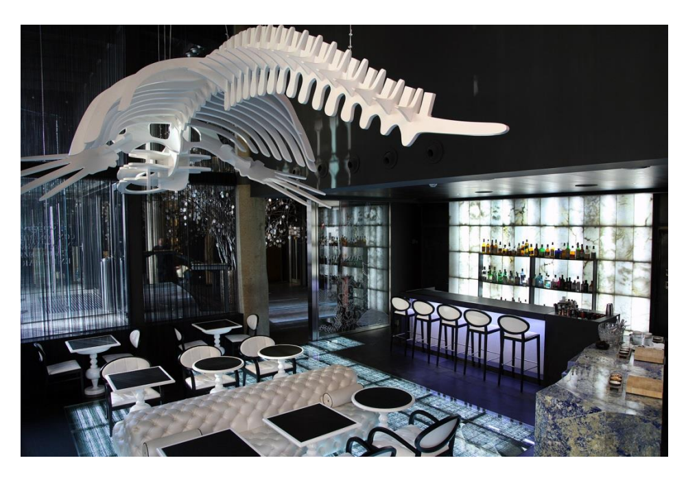
Glass Mar of the Hotel Urban