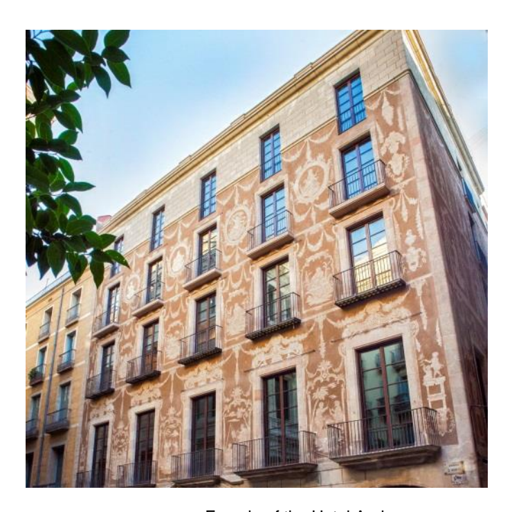
Façade of the Hotel Arai

In short, this commitment to art and culture has been extended to each one of the Derby Hotels Collection establishments and has incorporated gastronomy in recent years as a perfect complement to achieving the luxury experience sought by the group.